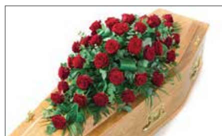
Floral Tributes - Rose Coffin Spray