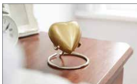
Memories - Heart Shaped Keepsake