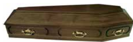
Derg African ayous wood with a matt finish.