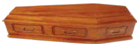
Lagan South American kiri wood coffin with a gloss finish.