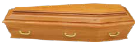
Bann European pine coffin with a satin finish.