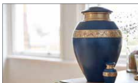
Memories - Anoka Urn