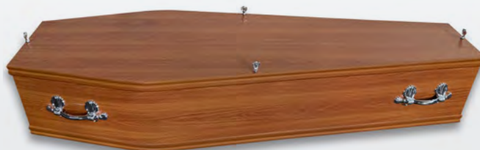
Wood effect coffin featuring flat lid and sides

We are here for you 24 hours a day 365 days a year